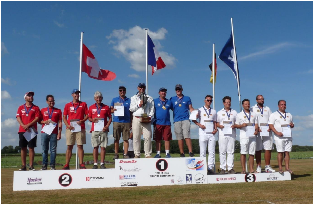
Team champions: France, Switzerland, Germany