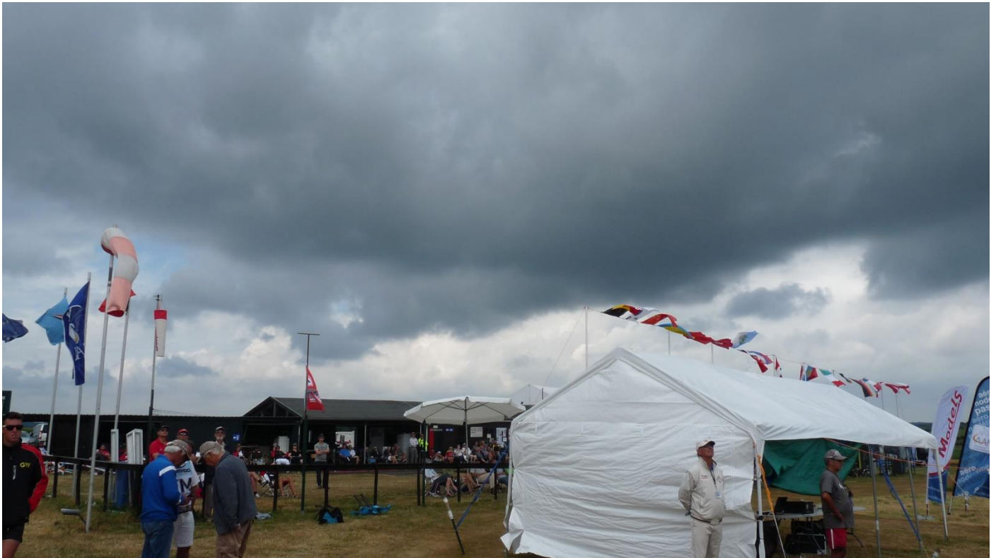
Windy and very cloudy threatening air