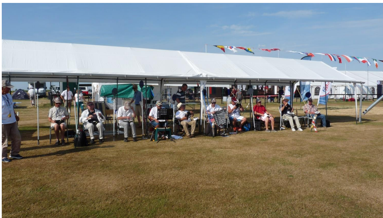
The complete team of judges, well prepared and ready to go