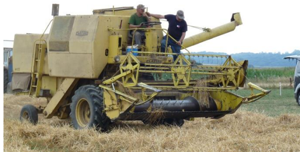
Work must go on