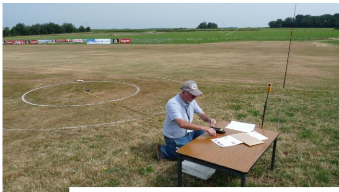
Officials are ready for model processing on the field