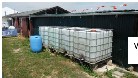
Waterreservoirs, 4000 L drinking water

Behind the scene there is a lot of equipment required for support