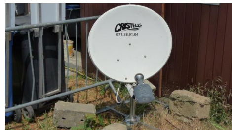
Satellite receiver and transmitter for connection with the rest of the world