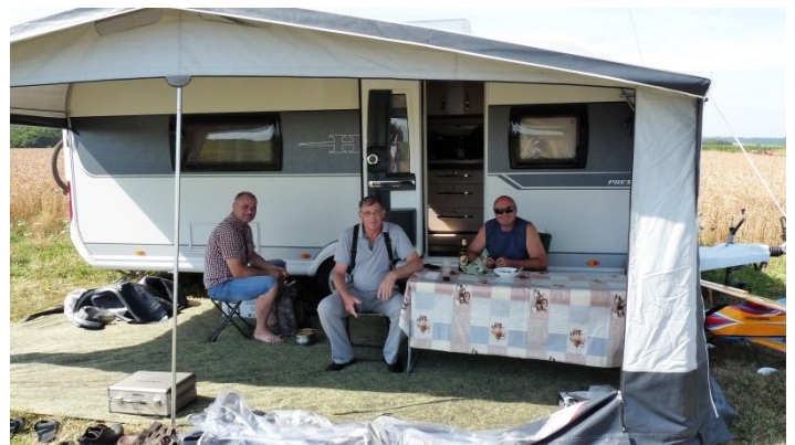
Team Russia arrived and installed after a very long more then 2000 km drive