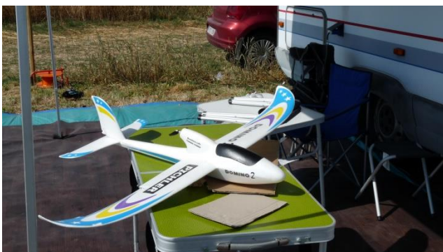
Some other plane for in the evening?